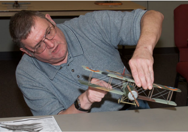
double 'flying wires' on the wings. So, there is a lot going on here, assembly-wise, and we think

coming next. And yes, Stan also had a 1/32 Salmson 2-A2 completed in the markings of the USAS (U.S. Air Service.) He encountered no problems during the build, and we have to say that this model is somewhat bigger than we expected. It was painted with Tamiya acrylics, and rigged with 0.015" piano wire. We should also mention that this is a 'double bay' biplane, requiring more rigging per wing than the usual single bay type, and also that the rigging features